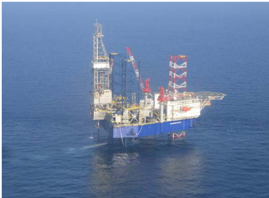
The jack-up drill rig 'Aquamarine Driller'

Nido Petroleum Limited (Nido), as Operator of Service Contract 54A (SC 54A), is pleased to advise that the schedule for the jack-up drill rig 'Aquamarine Driller' is firming up in relation to the completion and production testing of the Tindalo-1 well. The rig is now expected to be contracted to Nido in mid-April with in-field project execution work beginning late April. The rig and associated equipment will remain on site as the production facility for the field following successful production testing of the well.